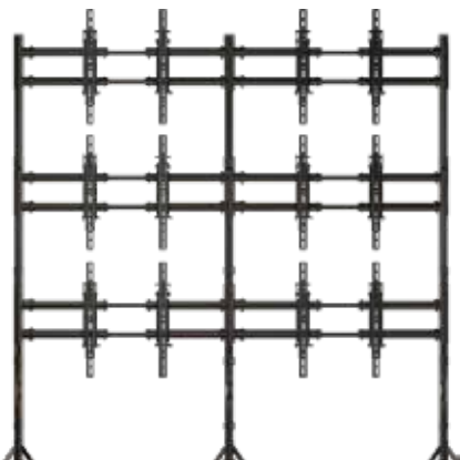
MPVW-MODFW-L86V (47-60"+ displays)