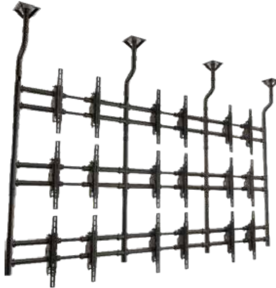
MPVW-MODC-M86V (40-47" displays)