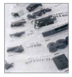
Mounting Hardware Complete set of screen mounting hardware, labeled for ease of use and ready to go.