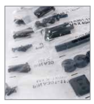
Mounting Hardware Complete set of mounting hardware, labeled for ease of use and ready to go.