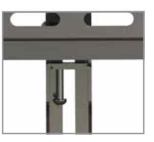
Pre-Installed Securing Screws Easy hook and secure installation and preassembled securing screw makes installation fast and easy.