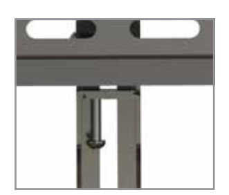
Pre-Installed Securing Screws Easy hook and secure installation and preassembled securing screw makes installation fast and easy.