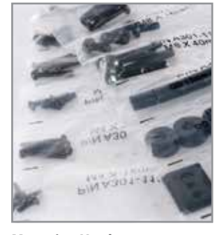
Mounting Hardware Complete set of mounting hardware, labeled for ease of use and ready to go.