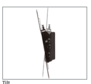
Pre-tensioned tilt mechanism allows for 15° forward and 5° backward tilt for optimal viewing angles.