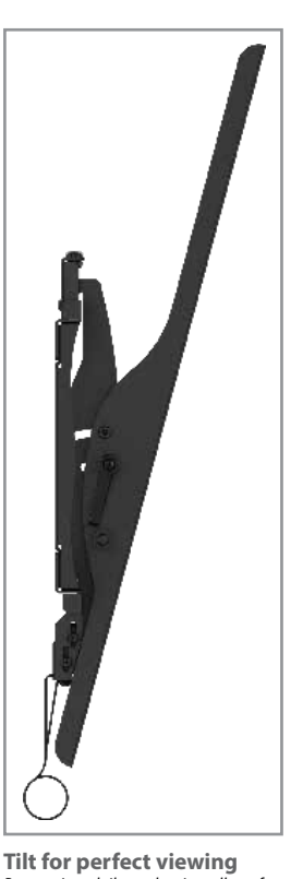
Tilt for perfect viewing Pre-tensioned tilt mechanism allows for smooth tilt adjustment of 15° forward and 5° back.