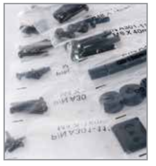
Mounting Hardware Complete set of display mounting hardware, labeled for ease of use and ready to go.