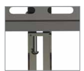
Pre-Installed Securing Screws Easy hook and secure installation and preassembled securing screw makes installation fast and easy.