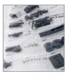
Mounting Hardware Complete set of screen mounting hardware, labeled for ease of use and ready to go.