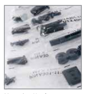
Mounting Hardware Complete set of screen mounting hardware, labeled for ease of use and ready to go.