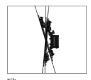
111t 15° forward and 5° back tilt for optimal viewing angles.