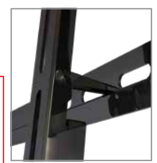
Built-in Kickstand Kickstand holds display away from wall for easy cord installation.