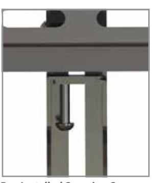
Pre-Installed Securing Screws Easy hook and secure installation and pre-assembled securing screws makes installation fast and easy.