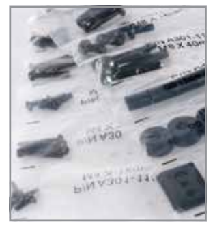
Mounting Hardware Complete set of display mounting hardware, labeled for ease of use and ready to go.