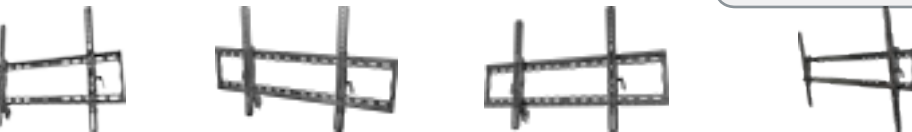
MPT-X116U 46-65+" Screen Size