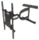
MPA-L44U 37-55" Screen Size