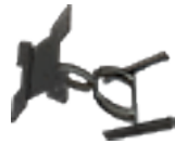
MPA-L44V 32-55" Screen Size