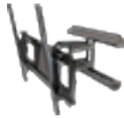
MPA-L75U 37-63" Screen Size