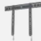
MPFU-L64U 30-55" Screen Size