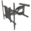
MPA-X86U 37-63" Screen Size