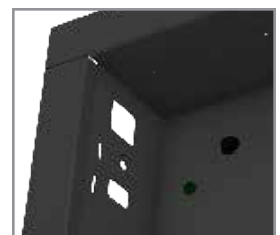
Ground Wire Connection

Complete the solution by choosing from over 20 different Mustang mounts from ultra-flat to full articulating.