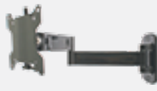
MPA-S11V 10-30" Screen Size