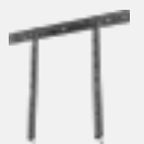
MPFU-X84U 37-60" Screen Size