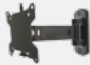
MPP-S11V 10-30" Screen Size