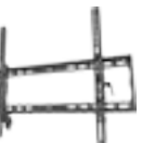
MPT-L65UL 32-55" Screen Size