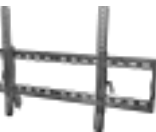
MPT-X85U 37-63" Screen Size