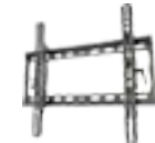
MPT-M44U 26-46" Screen Size