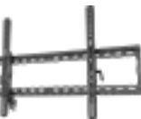
MPT-X85UL 37-63" Screen Size