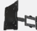
MPA-M44V 13-40" Screen Size