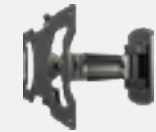
MPP-S21V 13-32" Screen Size