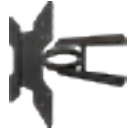
MPP-L44V 32-55" Screen Size