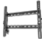
MPT-M44UL 26-46" Screen Size