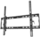
MPT-L65U 32-55" Screen Size