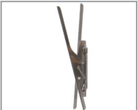
Tilt 15° forward and 5° back tilt for optimal viewing angles.