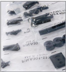
Mounting Hardware Complete set of screen mounting hardware, labeled for ease of use and ready to go.