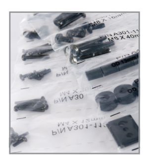
Mounting Hardware Complete set of mounting hardware, labeled for ease of use and ready to go.