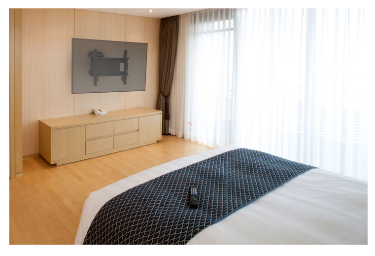
Articulating mount for 37" to 75" displays<sup>*</sup>. Multiple joint arms hold display 3.5" from wall when retracted and 27" when fully extended. Smooth tilt adjustments of +15^{\circ} (forward) and -5^{\circ} (back) with a locking knob and 3^{\circ} side-to-side roll facilitates a variety of viewing angles and perfect positioning. Makes a secure installation quick and easy, simply hang the display and turn the pre-assembled securing screws to lock in place. Integrated cable management for clean look.