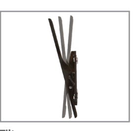
Tilt 15° forward and 5° back tilt for optimal viewing angles.