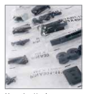
Mounting Hardware Complete set of screen mounting hardware, labeled for ease of use and ready to go.