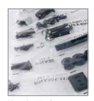
Mounting Hardware Complete set of screen mounting hardware, labeled for ease of use and ready to go.