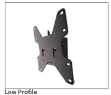
Low Profile design to keep display close to wall for clean proffesional look.