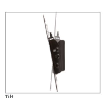
Pre-tensioned tilt mechanism allows for 15° forward and 5° backward tilt for optimal viewing angles.