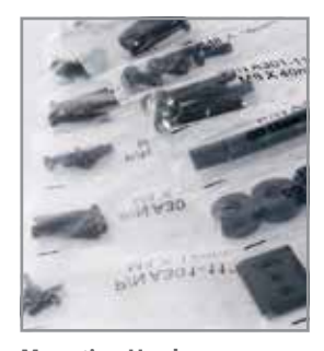
Mounting Hardware Complete set of mounting hardware. labeled for ease of use and ready to go.