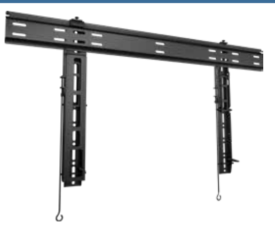
Ultra-flat tilting mount for 32" to 60" flat panel display. Super slim universal design holds displays only .97" (24.6mm) from wall. A perfect match for today's slim TVs. Post-installation leveling feature allows for perfect display positioning even when ceiling is not perfectly level. Quick and secure "hook and click" installation with built-in kickstand feature that allows easy access for wiring.