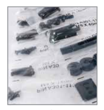
Mounting Hardware Complete set of mounting hardware, labeled for ease of use and ready to go.