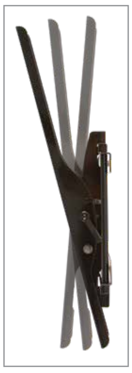
Tilt for perfect viewing Pre-tensioned tilt mechanism allows for smooth tilt adjustment of 15° forward and 5° back.