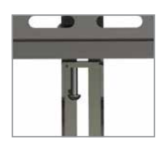
Pre-Installed Securing Screws Easy hook and secure installation and preassembled securing screw makes installation fast and easy.