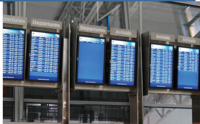
Dedicated Portrait Models